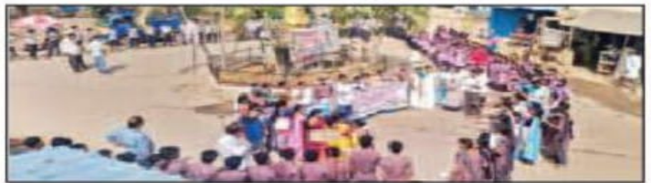
వైఎస్సార్ సర్కిల్లో మానవహళం ఏర్పడిన దృశ్యం

కంబదూరు డిసెంబరు 01 (ప్రభుత్వాన్): ఆంధ్రప్రదేశ్ ఎయిడ్స్ కంట్రోల్ సొసైటీ, జిల్లా ఎయిడ్స్ నియంత్రణ విభాగం వారి ఆదేశాల మేరకు రిడ్స్ సంస్థ ప్రభుత్వ జూనియర్ కళాశాల, ప్రభుత్వ ఉన్నత పాఠశాల ఆధ్వర్యంలో అంతర్జాతీయ ఎయిడ్స్ డే దినోత్సవ కార్యక్రమం మండల కేంద్రంలో శుక్రవారం నిర్వహించారు. ప్రభుత్వ హాస్పిటల్ నుండి ర్యాళీగా మొదలై వై.యస్సార్ సర్కిల్ లో మానవ హళంగా ఏర్పడి హెచ్.ఐ.వి నిర్మూలన గురించి నినాదాలు చేస్తూ అక్కడినుండి పాత పోస్ట్ ఆఫీస్ సర్కిల్, ఎన్టీఆర్ సర్కిల్, మీదుగా డాక్టర్. బి.ఆర్.అంజేద్వర్ సర్కిల్ వరకు ర్యాళీ కొనసాగింది. ఈ కార్యక్రమంలో ప్రభుత్వ ఆసుపత్రి సిబ్బంది, ఐ.సి.డి .ఎస్ సిబ్బంది, రిడ్స్ సిబ్బంది, ప్రభుత్వ జూనియర్ కళా శాల సిబ్బంది, ప్రభుత్వ ఉన్నత పాఠశాల సిబ్బంది, ప్రభుత్వ జూని యర్ కళా శాల, ప్రభుత్వ ఉన్నత పాఠశాలలోని, 250మంది విద్యార్థులు పాల్గొన్నారు.