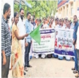
గుత్తిలో ర్యాలీని ప్రారంభిస్తున్న వ్యాధివారి డిప్టీ