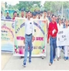
రాయదుర్గం టౌన్లో: ర్యాలీ నిర్వహిస్తున్న కేటీఎస్ డిగ్రీ విద్యార్థులు

ఎయిడ్స్ ను నిర్మూలిద్దాం అంతర్జాతీయ ఎయిడ్స్ నివారణ దినాన్ని ఘనస్థరంపనుని ఉద్ఘాటించి నివారణ విభాగం, పలు స్థానాల నుండి సుస్థం ఆధ్వర్యంలో కుక్కవారం నిర్వహించారు. వైద్య సిబ్బంది, మహిళా సంఘాల సభ్యులు, విద్యార్థులు ఎయిడ్స్ నివారణపై అవగాహన కల్పిస్తూ, మానవచరని నిర్వహిస్తున్న వివరాలను వివరించారు. ఈ కార్యక్రమంలో మానవచరంగా ఏర్పడ్డారు. ఎయిడ్స్ రోగిత సమాజాస్పాదన కోసం కృషి చేస్తామని ప్రతిజ్ఞ చేశారు. - ఆంధ్రజ్యోతి, న్యూస్ డివీజన్