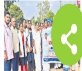
యాదాకిలో ఎయిడ్స్ నిరోధకంపై ర్యాలీ నిర్వహిస్తున్న చైర్మన్ సిబ్బంది