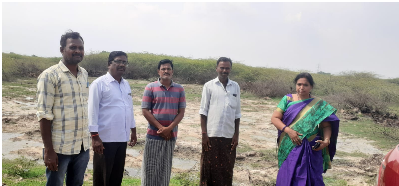
DDM Visit in Kallumadi FPO