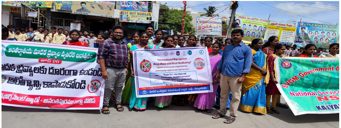
Meeting and Training, field activity photos