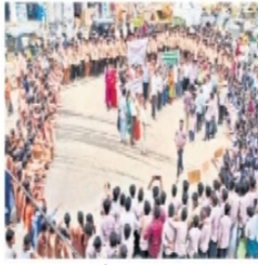
కళ్యాణదుర్గం టీ సర్కిల్లో మానవచరంగా ఏర్పడి ప్రతిజ్ఞ చేస్తున్న విద్యార్థులు