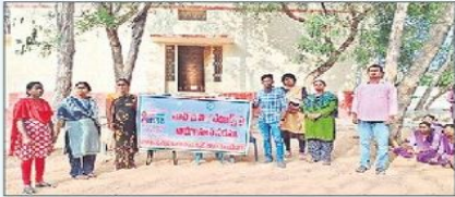
కంబదూరు: అవగాహన కల్పిస్తున్న రిడ్స్ ప్రతినిధులు