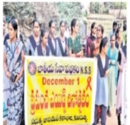
కుందుర్తి: ఎయిడ్స్ పై ర్యాలీ నిర్వహిస్తున్న విద్యార్థులు