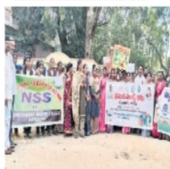
రాయదుర్గం: ర్యాలీ నిర్వహిస్తున్న విద్యార్థులు

ఎయిడ్స్ ను నిర్మూలిద్దాం అంతర్జాతీయ ఎయిడ్స్ నివారణ దినాన్ని ఘనస్థరంపనుని ఉద్ఘాటించి నివారణ విభాగం, పలు స్థానాల నుండి సుస్థం ఆధ్వర్యంలో కుక్కవారం నిర్వహించారు. వైద్య సిబ్బంది, మహిళా సంఘాల సభ్యులు, విద్యార్థులు ఎయిడ్స్ నివారణపై అవగాహన కల్పిస్తూ, మానవచరని నిర్వహిస్తున్న వివరాలను వివరించారు. ఈ కార్యక్రమంలో మానవచరంగా ఏర్పడ్డారు. ఎయిడ్స్ రోగిత సమాజాస్పాదన కోసం కృషి చేస్తామని ప్రతిజ్ఞ చేశారు. - ఆంధ్రజ్యోతి, న్యూస్ డివీజన్