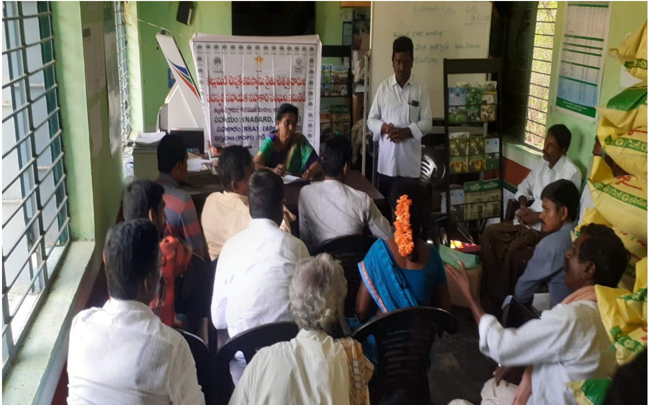
Kallumadi BOD Meeting attend in DDM NABARD