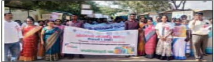
ఎయిడ్స్ ర్యాళి నిర్వహిస్తున్న విద్యార్థులు

కంబదూరు డిసెంబరు 01 (ప్రభుత్వాన్): ఆంధ్రప్రదేశ్ ఎయిడ్స్ కంట్రోల్ సొసైటీ, జిల్లా ఎయిడ్స్ నియంత్రణ విభాగం వారి ఆదేశాల మేరకు రిడ్స్ సంస్థ ప్రభుత్వ జూనియర్ కళాశాల, ప్రభుత్వ ఉన్నత పాఠశాల ఆధ్వర్యంలో అంతర్జాతీయ ఎయిడ్స్ డే దినోత్సవ కార్యక్రమం మండల కేంద్రంలో శుక్రవారం నిర్వహించారు. ప్రభుత్వ హాస్పిటల్ నుండి ర్యాళీగా మొదలై వై.యస్సార్ సర్కిల్ లో మానవ హళంగా ఏర్పడి హెచ్.ఐ.వి నిర్మూలన గురించి నినాదాలు చేస్తూ అక్కడినుండి పాత పోస్ట్ ఆఫీస్ సర్కిల్, ఎన్టీఆర్ సర్కిల్, మీదుగా డాక్టర్. బి.ఆర్.అంజేద్వర్ సర్కిల్ వరకు ర్యాళీ కొనసాగింది. ఈ కార్యక్రమంలో ప్రభుత్వ ఆసుపత్రి సిబ్బంది, ఐ.సి.డి .ఎస్ సిబ్బంది, రిడ్స్ సిబ్బంది, ప్రభుత్వ జూనియర్ కళా శాల సిబ్బంది, ప్రభుత్వ ఉన్నత పాఠశాల సిబ్బంది, ప్రభుత్వ జూని యర్ కళా శాల, ప్రభుత్వ ఉన్నత పాఠశాలలోని, 250మంది విద్యార్థులు పాల్గొన్నారు.