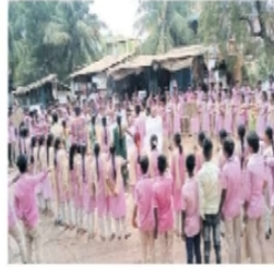
బొమ్మనచోడ: మానవచరంగా ఏర్పడిన కళాశాల విద్యార్థులు