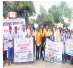
ఉరవకొండ: ర్యాలీలో పాల్గొన్న చైర్మణులు, లయన్ క్లబ్ సభ్యులు, విద్యార్థులు