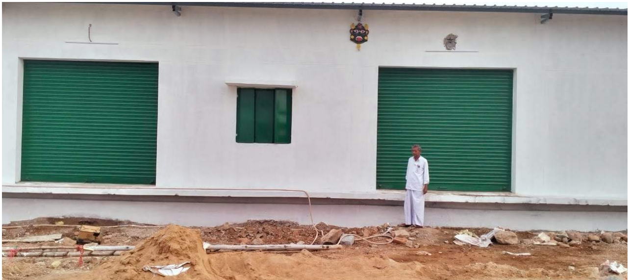
Cunstracion of CC Kotanka fpo