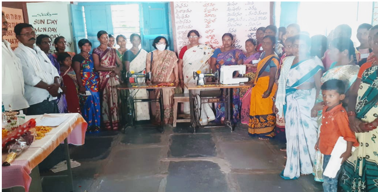
Womens Tailoring at Kallumadi Village

Kallumadi FPO (Kallumadi chennakesava swammy rupss) : The Kallumadi Farmers Producer Organization .Total share holders are 502 members. Equity mobilized Rs.502000, 5 Years business plan prepared submit to APMAS Hyd.the fpo is eligible for BDA 5lakhs.Training in BOD Members and CEO . 30 no Womens Tailoring Training under MEDP NABARD Programme.