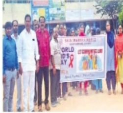
గుంతకల్లు టౌన్: శ్రీ శంకరాచందగిరి స్వామి డిగ్రీ కళాశాల ఆధ్వర్యంలో..